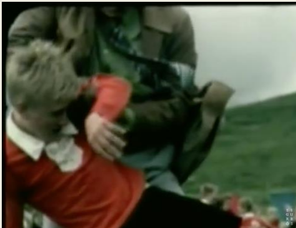
Viðrar vel til loftárása - Sigur Rós